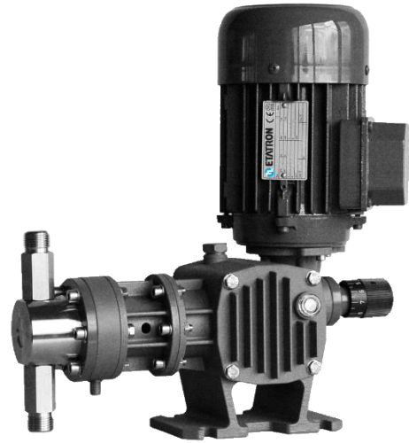
AP motor pump with AISI pump head

Can be built with an ATEX Zone 2 rated motor.